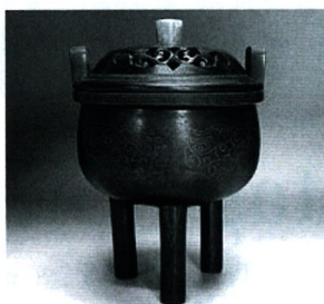
CHINESE BRONZE INLAID INCENSE BURNER.