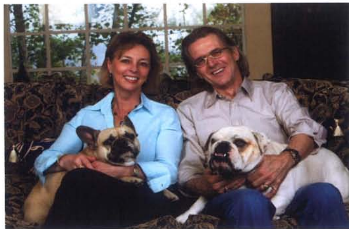
(Above Left): Tatmal Maskette, Papua New Guinea.

For the dealer or collector, however, that reality poses certain occupational dangers. "If ancestral spirits are not treated in a respectful way, bad luck will come," Harrison says. According to Harrison, the art world can be just as harsh. "You're only as good as your best piece," he says. —Lisa Stahl